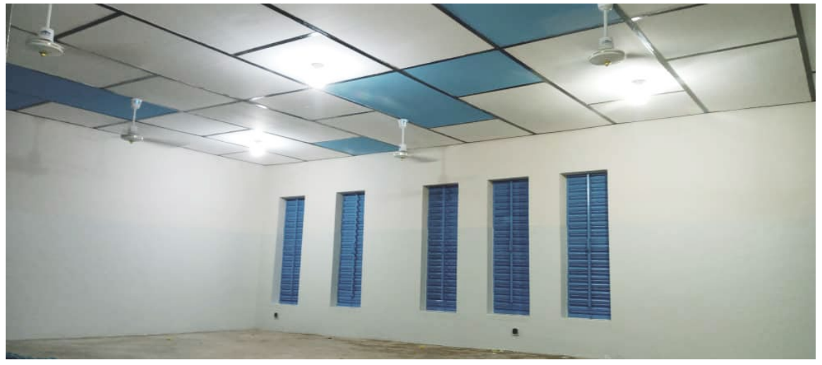
classroom in Djamballa