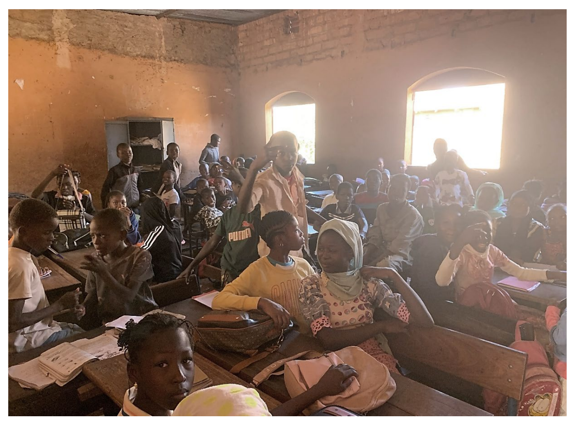
classroom in a public school, city of Kati, November 2023