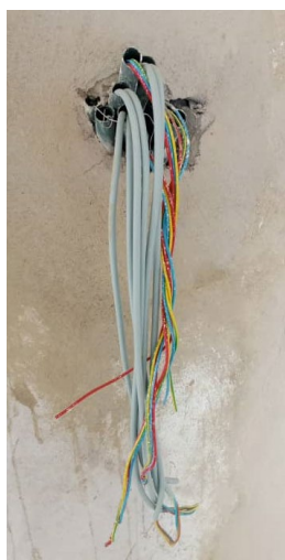
in parallel to the assembly of the false ceiling, the construction company carries out the wiring and installs all the electrical components.