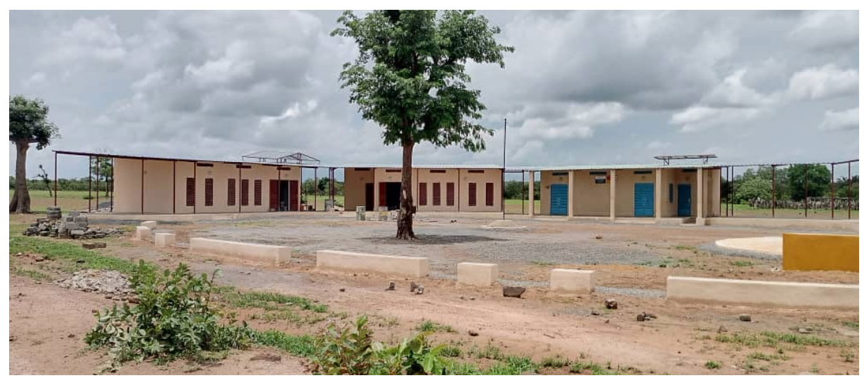
school, front view