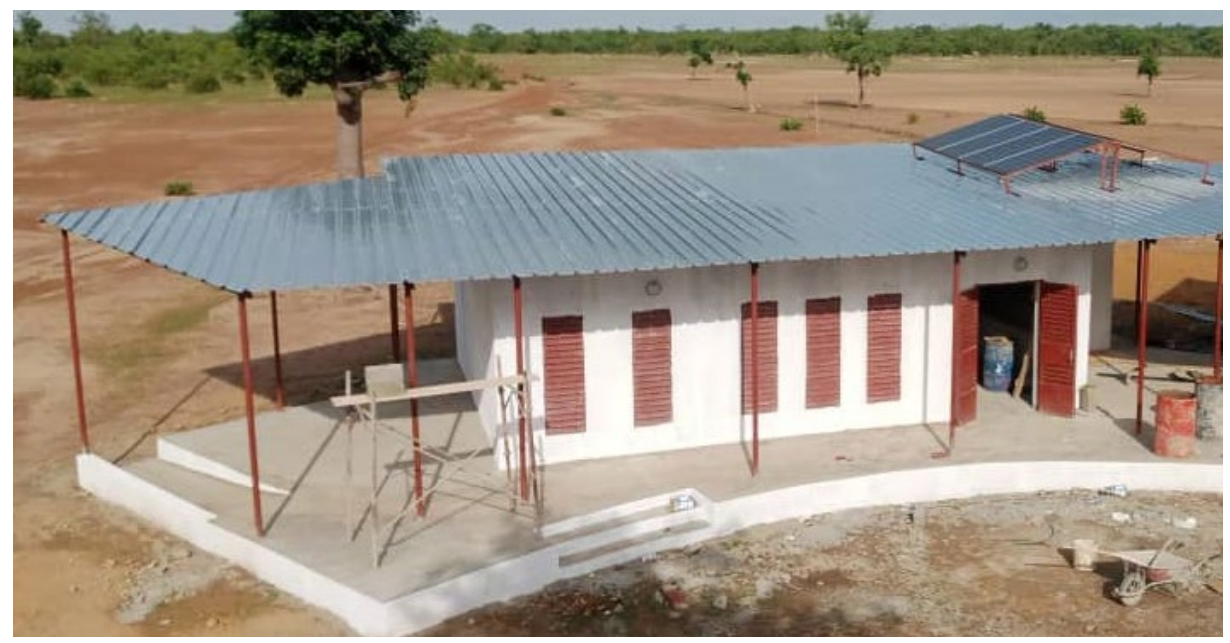
third classroom, front view