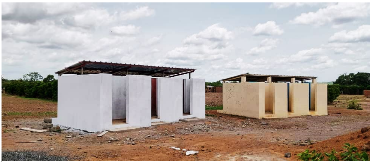
school latrines, second block