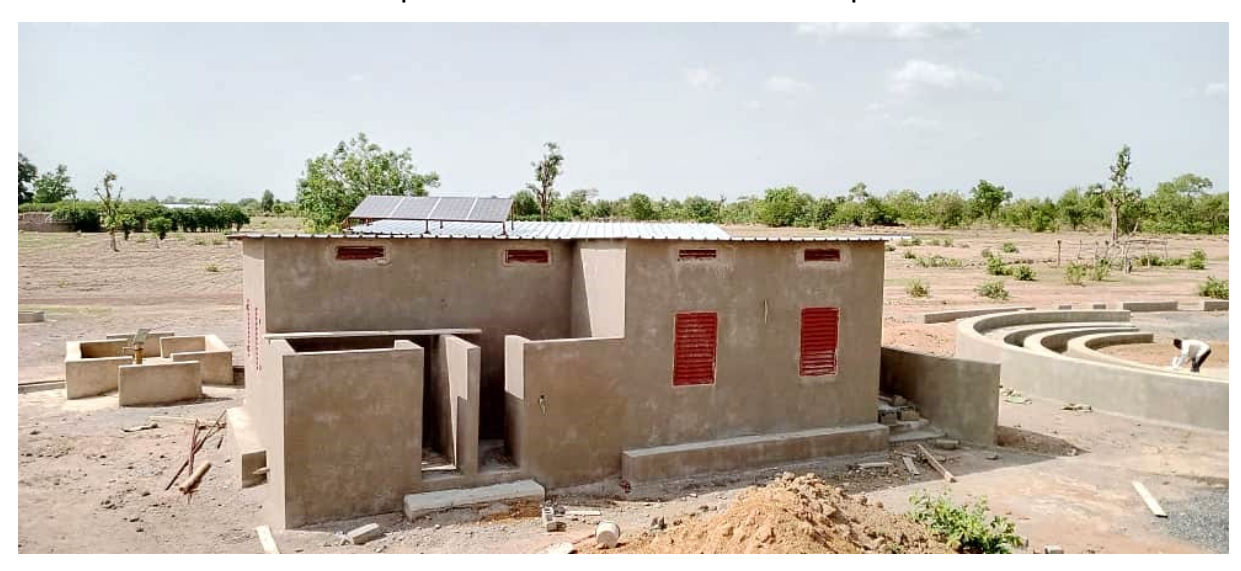
the installation of the solar panels for the teacher's apartments is completed.