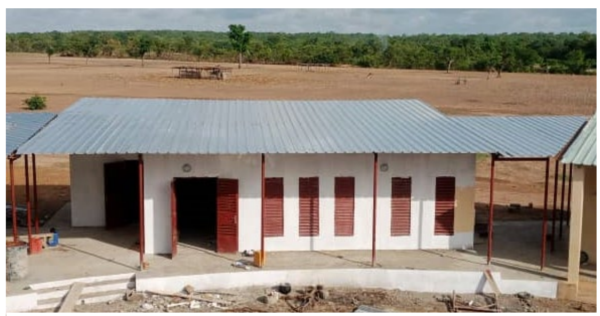
second classroom, front view