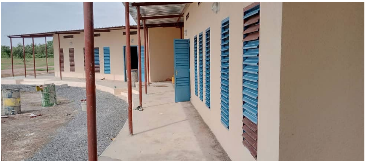
windows, doors, and all the vertical elements that support the roof will be painted blue.