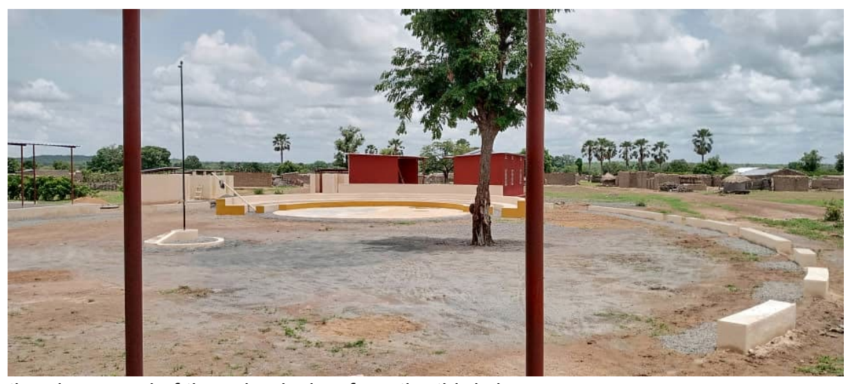
the playground of the school, view from the third classroom