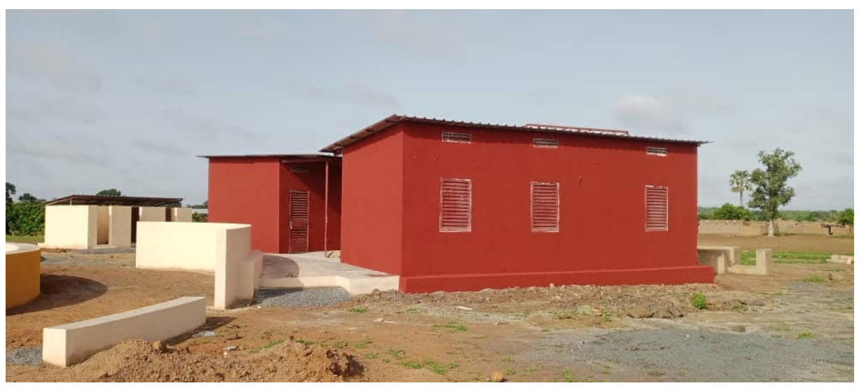
teachers'apartments, side view