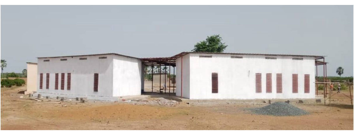
second and third classrooms, back view