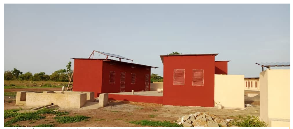
teachers'apartments, back view