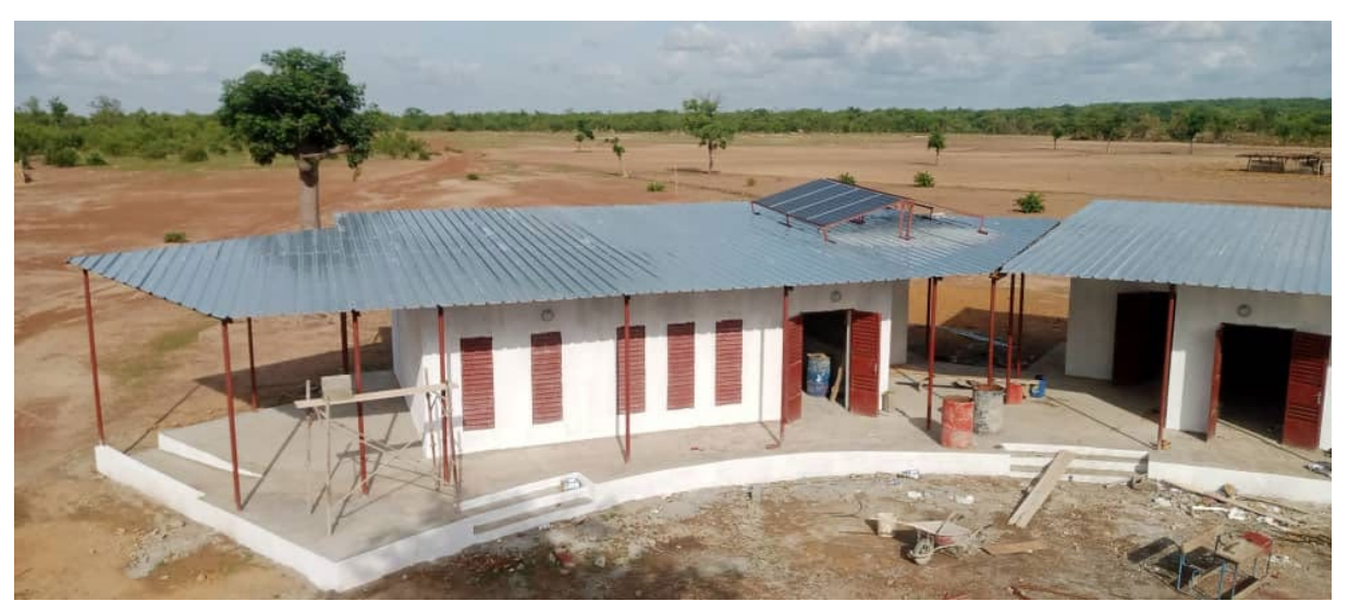
the installation of the solar panels for the classroom is completed.