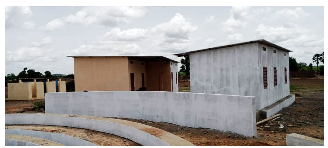
teacher's apartment, front view