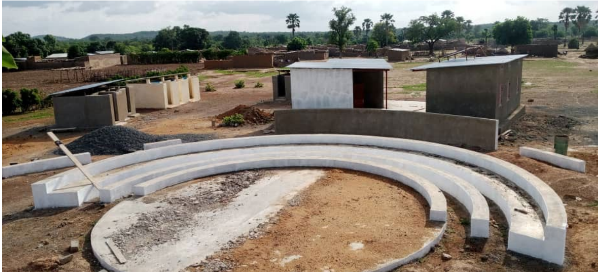
le petit amphithéâtre