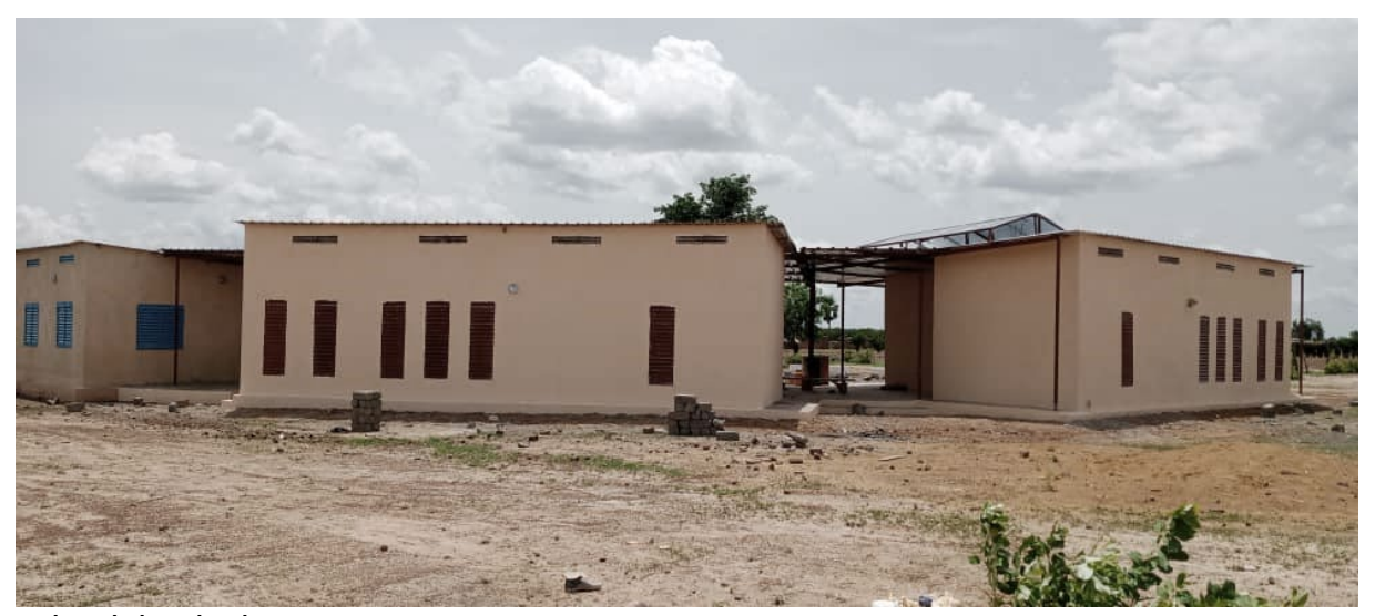
school, back view