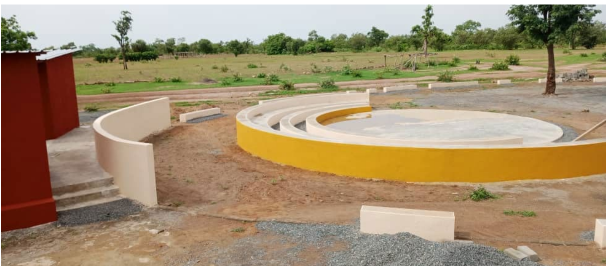
le petit amphithéâtre, views