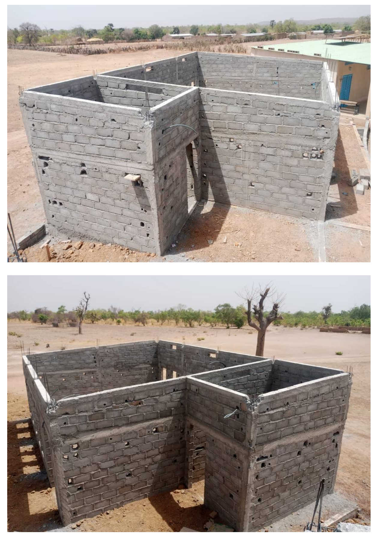
View of the classrooms with connected teacher's room