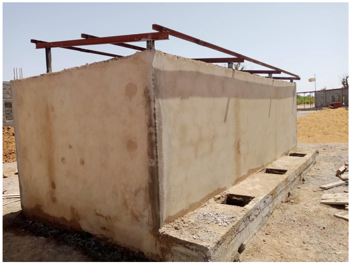
Back side, plastering in progress