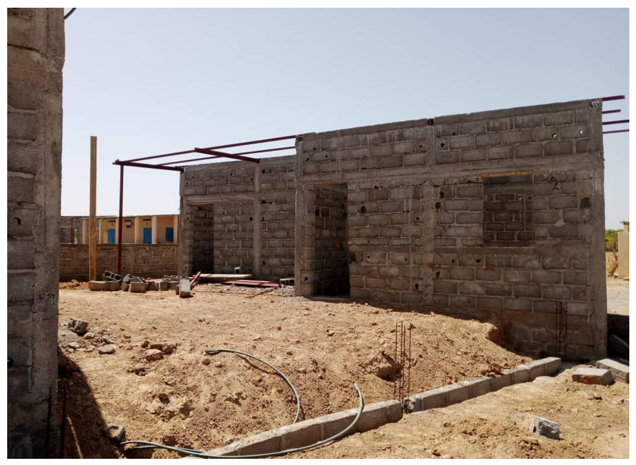
First and second apartment