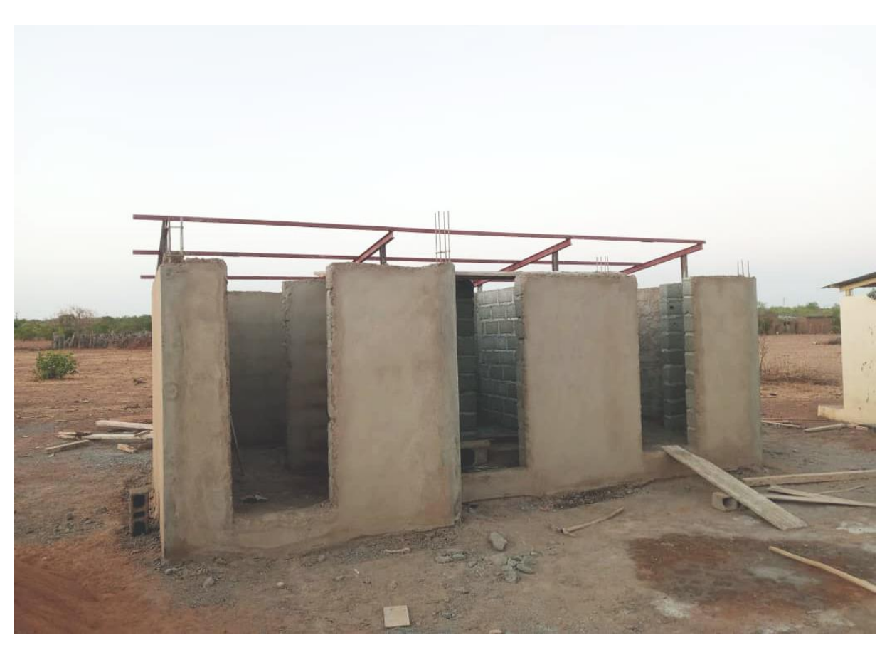
Front side, plastering in progress