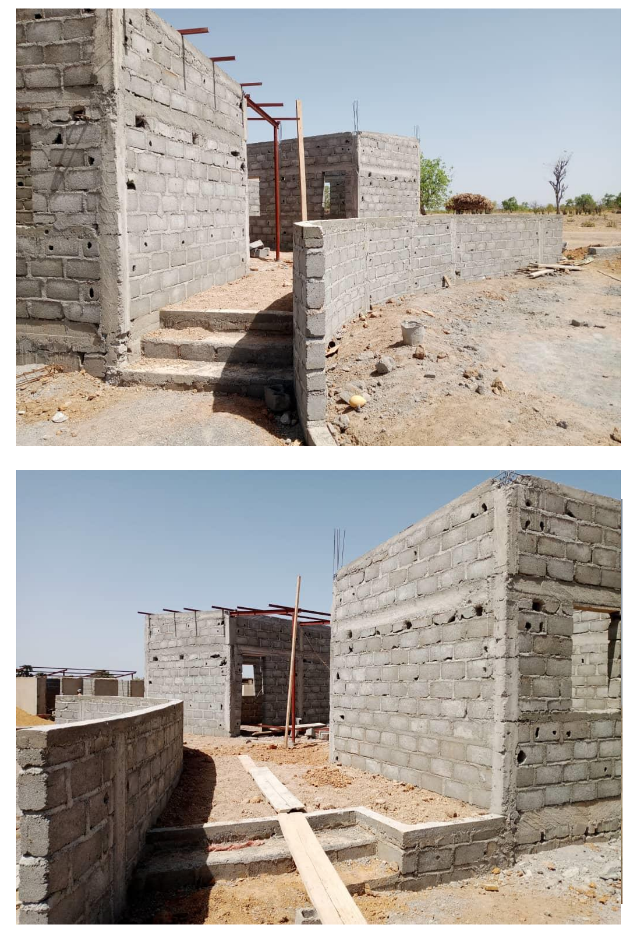
East side, accesses to the teachers' compound